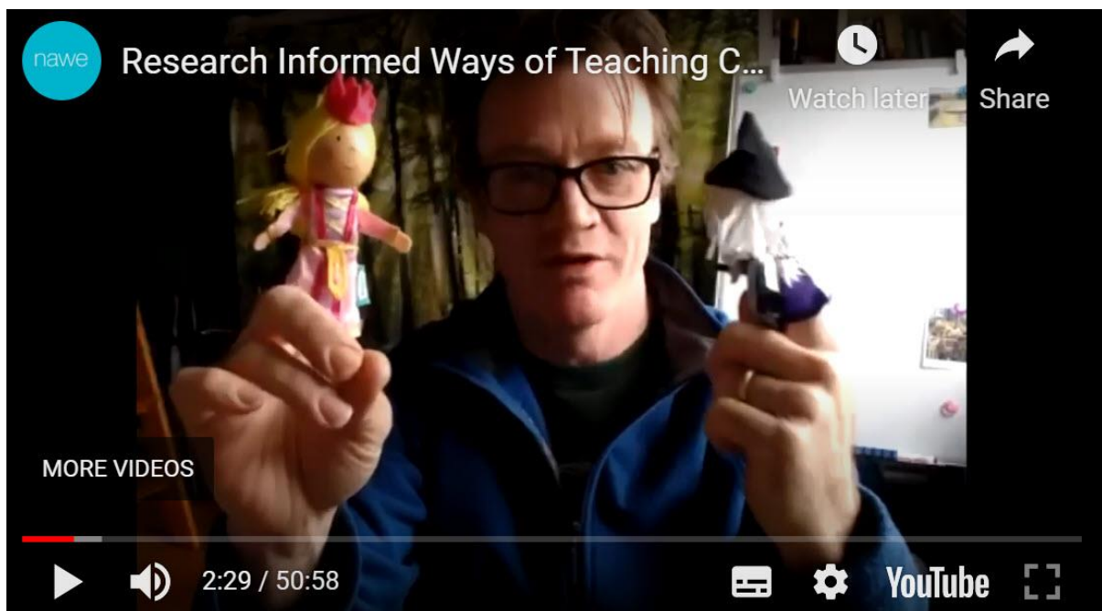
Figure 1 My inner princess meets the online wizard who will solve all my problems.

At the beginning of my NAWE workshop, I used puppets to tell a story which illustrated my key points about teaching online. I cannot pretend to be expert puppeteer or storyteller, but I offered my show in the spirit of playfulness. In Figure 1 you can see my 'inner princess' – the person in me who desires to be perfect – meeting the magic wizard who the princess wants to solve all her problems with teaching online.