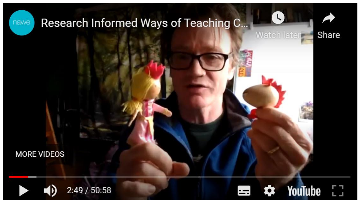
Figure 2 The princess meets her inner demons

Sadly, the wizard disappears and my inner princess falls down the 'learning pit': the place where learners get stuck. There, she meets a devil, who represents her doubts.