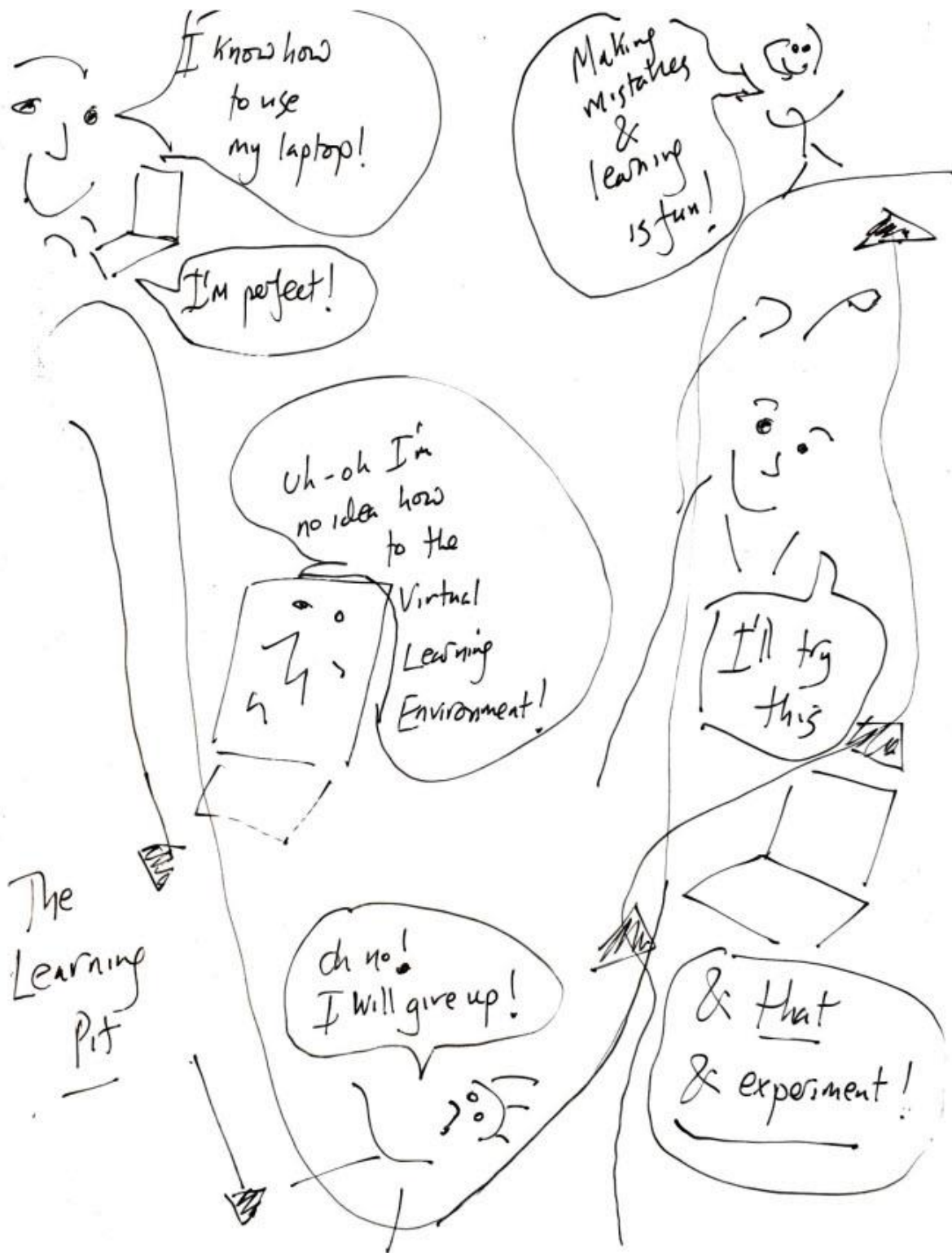
Figure 6 Falling Down the Learning Pit

During the rest of presentation, I offer some research-informed strategies for developing meaningful online learning, which included Hew's excellent research into what works with Massive Open Online Courses (2016) and Laurillard's seminal ABC method of designing online learning (2012: ABC Learning Design 2020). Please watch the video presentation for more on this.