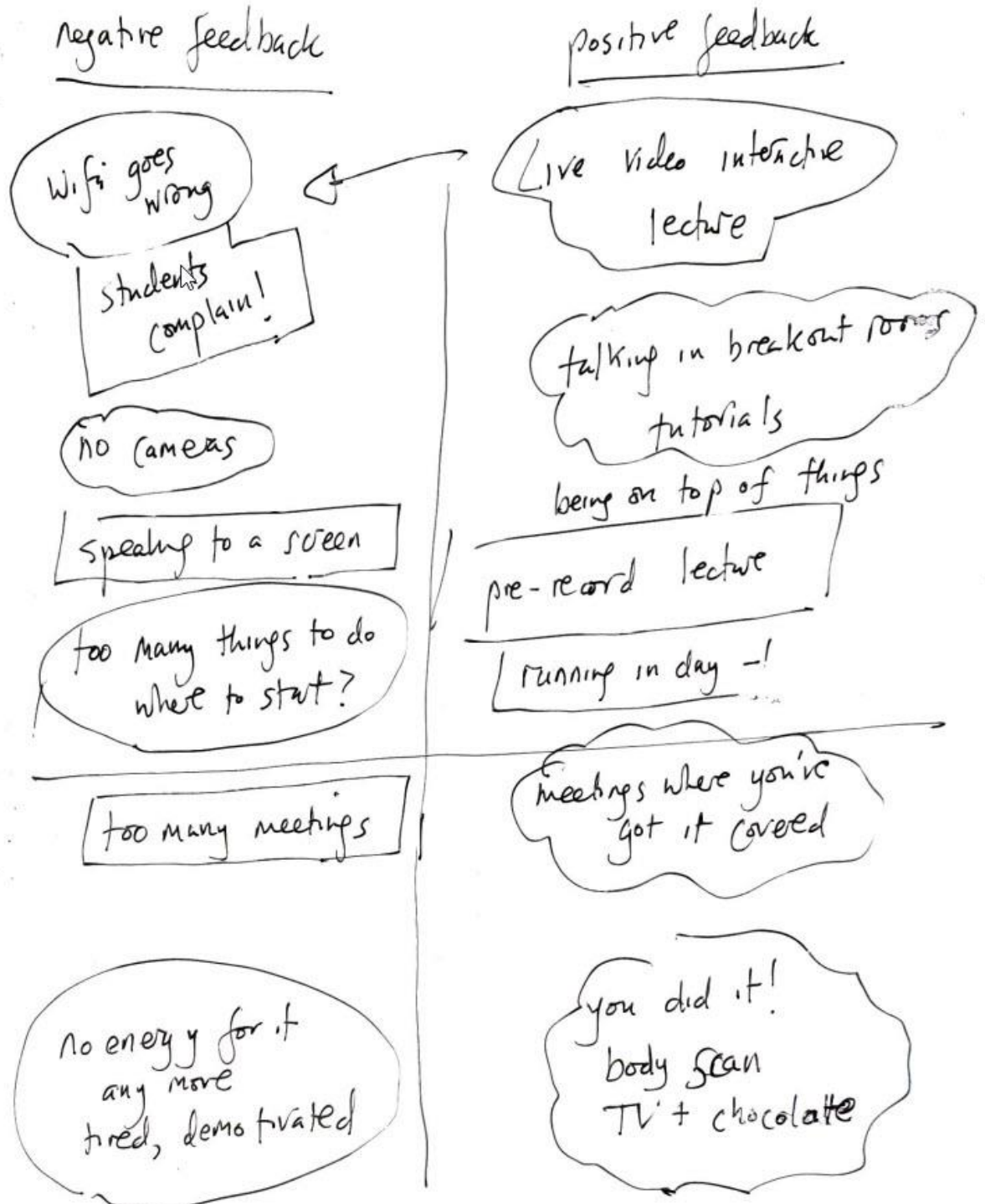
Figure 5 My circumplex about online teaching

You can see that 'high arousal' and pleasure in me is generated by positive student feedback, but high arousal 'displeasure' by negative feedback. Both generate a great deal of energy, but in different ways. So, the thing here is to consider how best to use this energy. I argue that as an online teacher you must take a 'Growth Mindset' approach (Dweck 2014) to online teaching as opposed to a 'Fixed Mindset'. The two approaches are outlined in the following table: